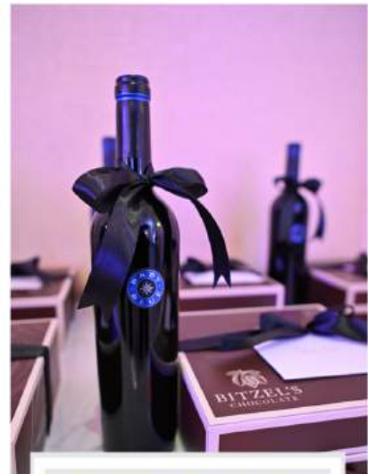
Gifts from Blue Rock Winery & our Thank You Sponsor Bitzel's Chocolates