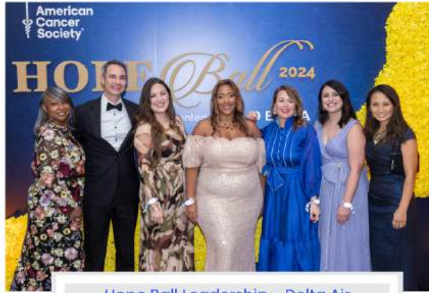
Hope Ball Leadership – Delta Air Lines Team and Executive Leadership