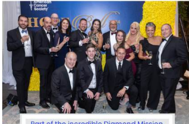
Part of the incredible Diamond Mission Sponsors - Gretchen's Gazelles Crew