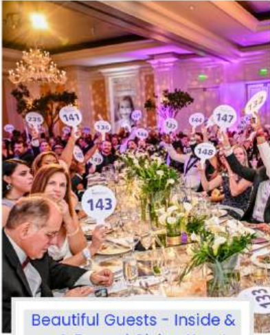
Beautiful Guests – Inside & out. Record Giving Year!