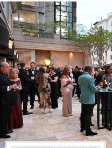
Patio Ambiance – added touch to cocktail hour