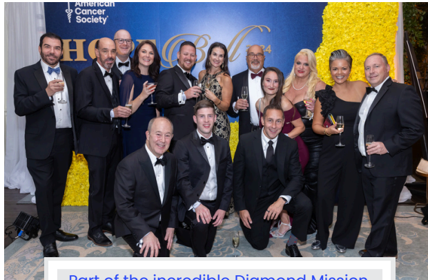
Part of the incredible Diamond Mission Sponsors - Gretchen's Gazelles Crew