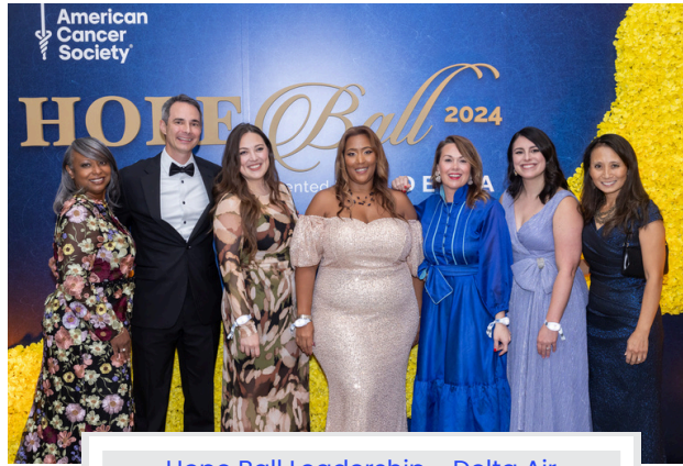
Hope Ball Leadership - Delta Air Lines Team and Executive Leadership