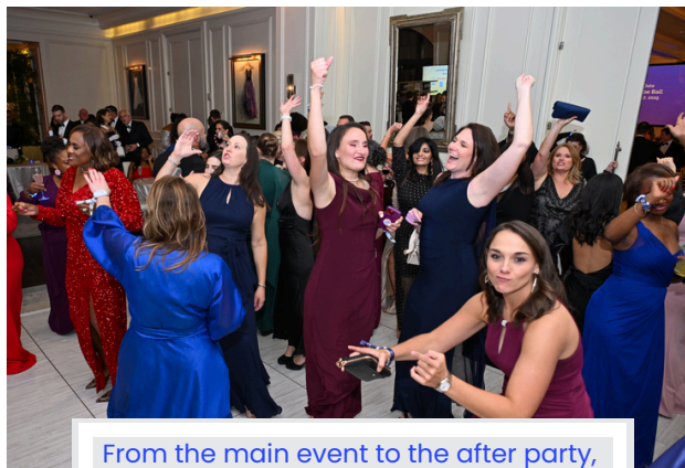
From the main event to the after party, DJ ERA kept the energy flowing!