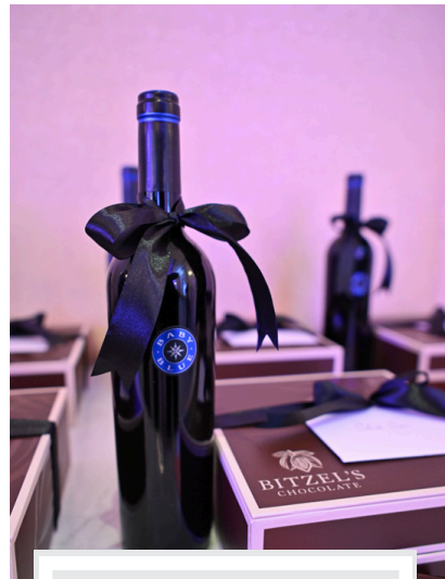
Gifts from Blue Rock Winery & our Thank You Sponsor Bitzel's Chocolates