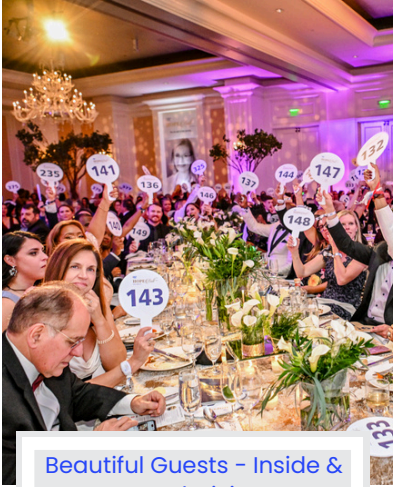
Beautiful Guests - Inside & out. Record Giving Year!