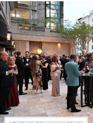
Patio Ambiance - added touch to cocktail hour