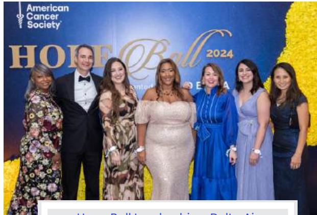
Hope Ball Leadership – Delta Air Lines Team and Executive Leadership