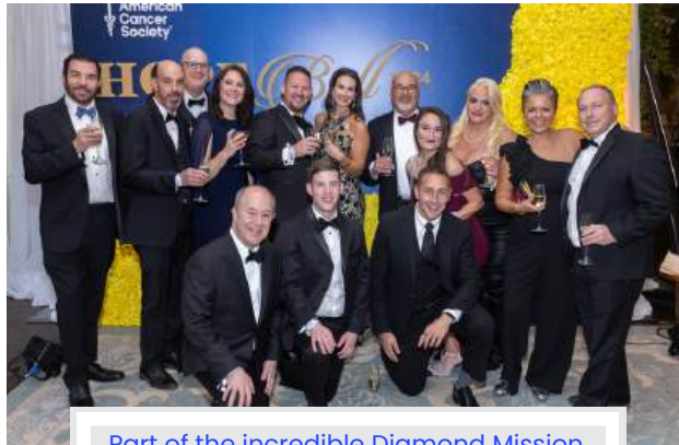
Part of the incredible Diamond Mission Sponsors - Gretchen's Gazelles Crew