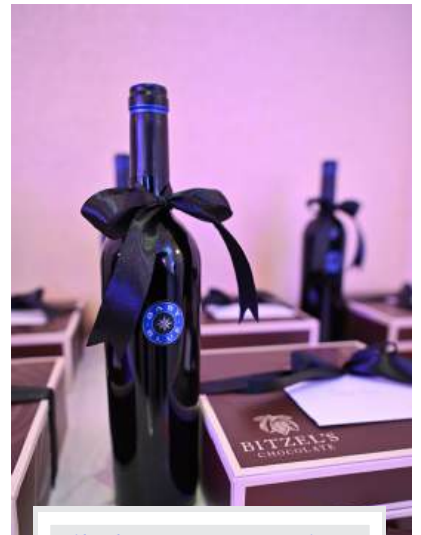
Gifts from Blue Rock Winery & our Thank You Sponsor Bitzel's Chocolates