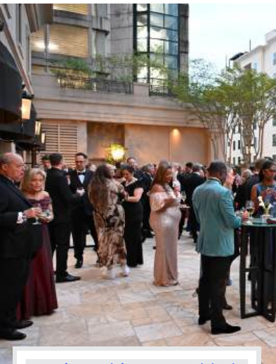
Patio Ambiance – added touch to cocktail hour