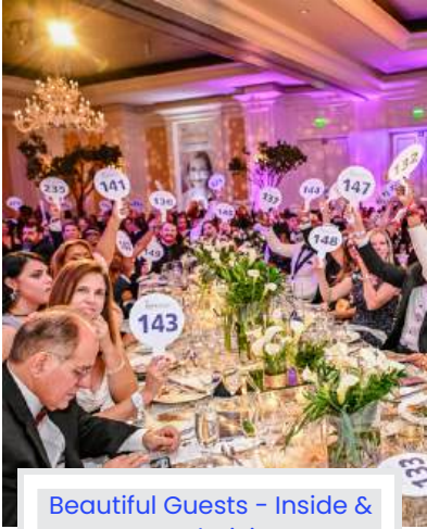
Beautiful Guests – Inside & out. Record Giving Year!